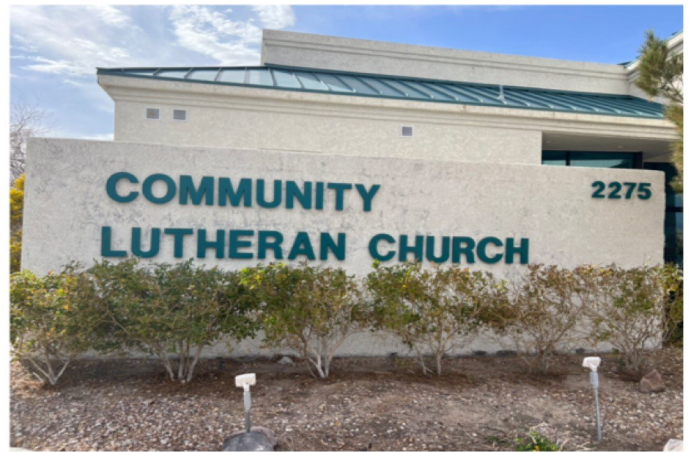
Second coat painted