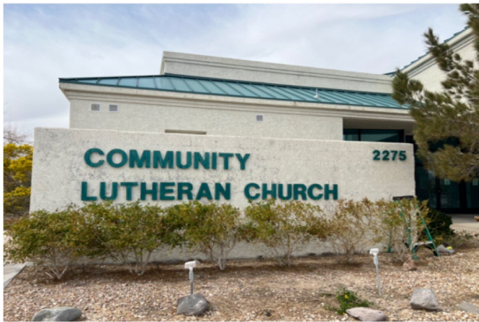
First coat painted