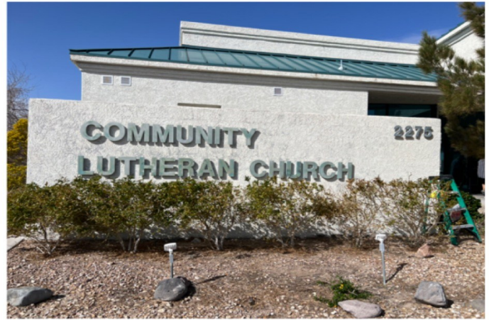
Sanded & Scrubbed