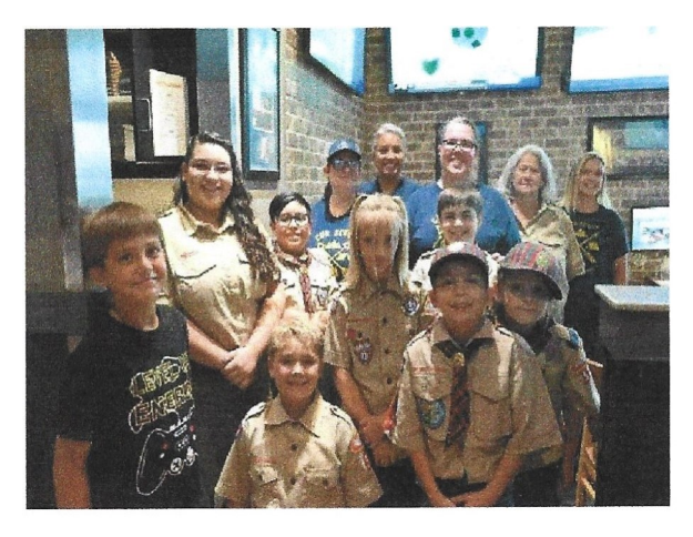
TROOP 56, BULLHEAD CITY, AZ CHAPTER