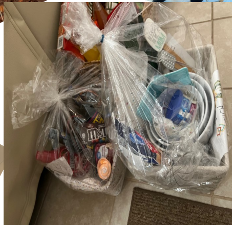
Beautiful baskets that were raffled off!!